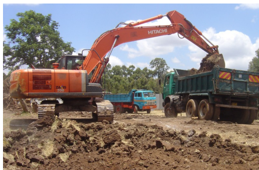
Your fave archbishop in the excavator