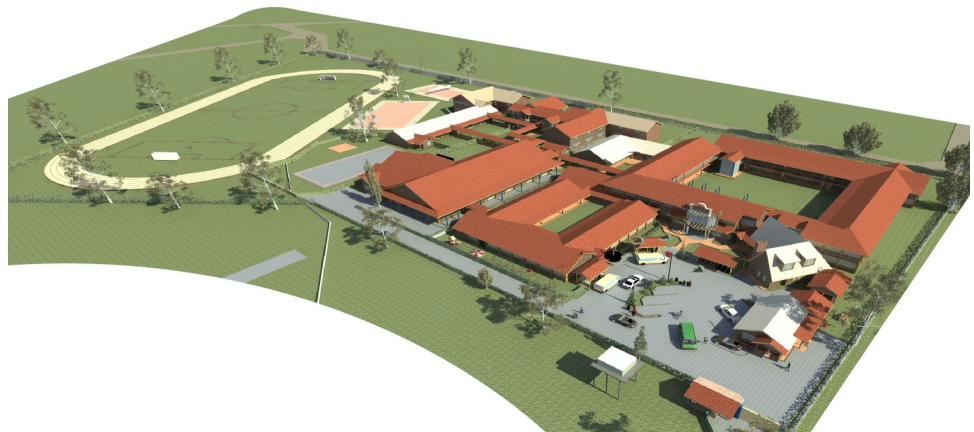
The Proposed Good Samaritan School at St. Nicholas