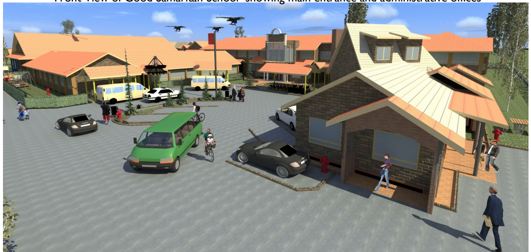
Front View of Good Samaritan School showing main entrance and administrative offices

The site plan calls for construction to be completed over multiple years in three phases: